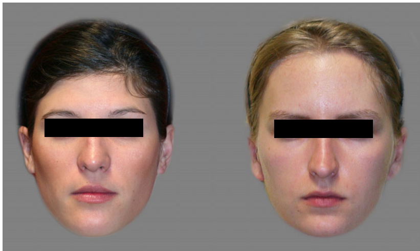
Fig. 1 Example of screenshot during the evaluation of women's facial attractiveness by the raters. For each pair of women, which was randomly chosen, the rater was instructed to click on the photograph of the woman that he found the most attractive. Photographs reproduced with permission. Faces were anonymized for publication.